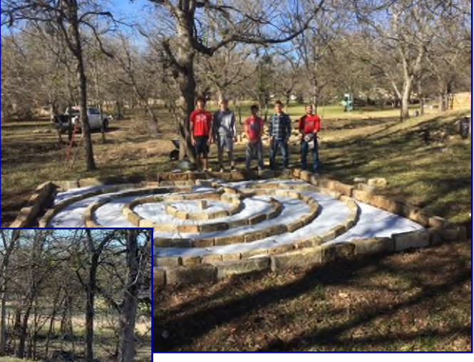
Labyrinths have been used for centuries to facilitate prayer and meditation. A labyrinth is a geometrically designed walking path leading to and from a